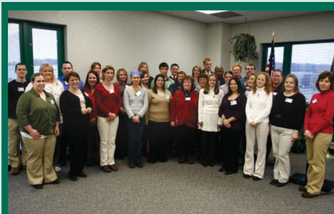
The photo on the front of this newsletter features Ivy Tech scholarship recipients for Spring Semester 2007.

The Bloomington campus continues to be a leader in growth both within its own college system and it