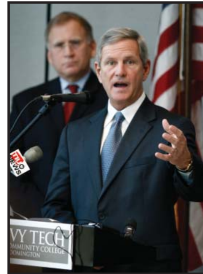
Congressman Baron Hill announces new legislation to assist college students with student loan debt.

Ninth District Representative Baron Hill announced that the House of Representatives recently approved legislation to cut interest on student loans during a press conference held January 26th at Ivy Tech.